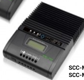
SCC-MPPT 600W / SCC-MPPT 850W